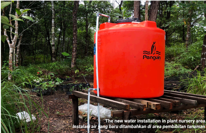
The new water installation in plant nursery area Instalasi air yang baru ditambahkan di area pembibitan tanaman