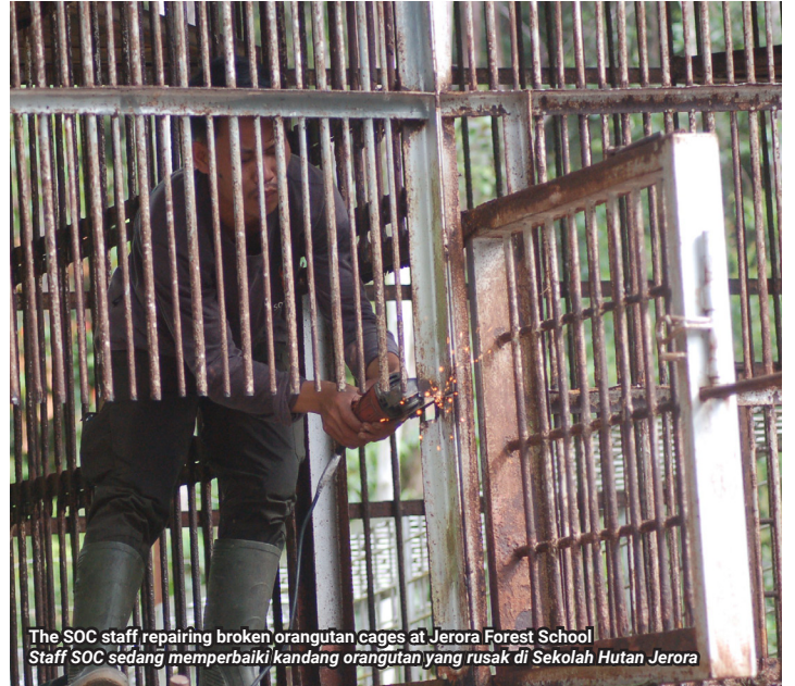
The SOC staff repairing broken orangutan cages at Jerora Forest School Staff SOC sedang memperbaiki kandang orangutan yang rusak di Sekolah Hutan Jerora

Pada bulan Oktober 2021, tim kami telah melakukan perawatan dan perbaikan rutin tahunan pada kandang-kandang, terutama pada kandang inap di pusat rehabilitasi dan di Sekolah Hutan Tembak dan Jerora. Kandang-kandang tersebut ada yang mengalami kerusakan akibat korosi dan kerusakan akibat keusilan orangutan remaja dan dewasa yang suka mencungkil besi-besi yang di kandang inap mereka.