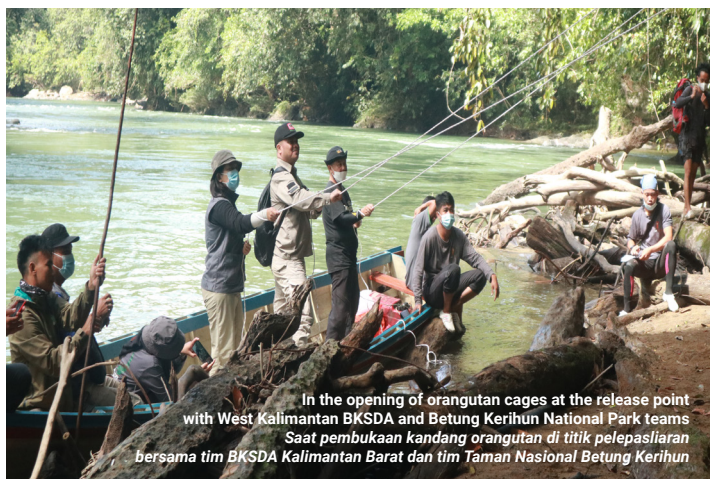
In the opening of orangutan cages at the release point with West Kalimantan BKSDA and Betung Keruhun National Park teams Saat pembukaan kandang orangutan di titik pelepasliaran bersama tim BKSDA Kalimantan Barat dan tim Taman Nasional Betung Keruhun