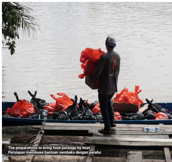
The preparations to bring food package by boat Persiapan membawa bantuan sembako dengan perahu

During the flood disaster in Sintang City, none of SOC's work sites were directly affected by the flood. However, the access road to the SOC office and the forest school is deep enough inundated so that it is difficult for vehicles other than a 4-wheel drive car and boat to pass. In addition, the supply of food for orangutans is also slightly hampered and prices have increased because feed sellers are experiencing difficulties in distributing feed stocks due to flooding.