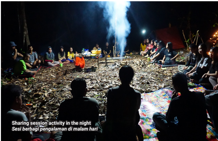
Sharing session activity in the night Sesi berbagi pengalaman di malam hari