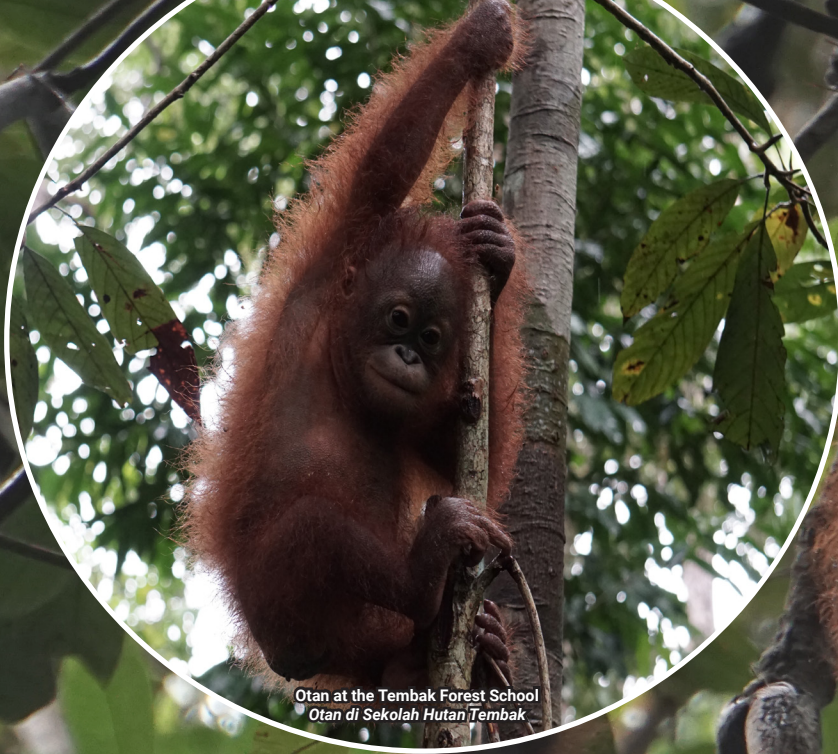
Otan at the Tembak Forest School Otan di Sekolah Hutan Tembak