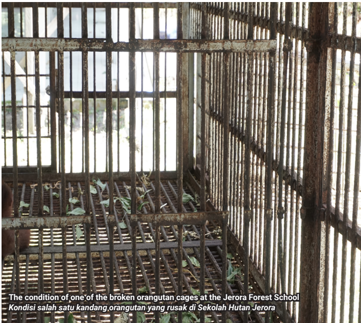
The condition of one of the broken orangutan cages at the Jerora Forest School Kondisi salah satu kandang orangutan yang rusak di Sekolah Hutan Jerora

In October 2021, our team had carried out routine annual maintenance and repairs on the cages, especially the night cages at the rehabilitation center and at the Tembak and Jerora Forest Schools. Some of these cages were damaged by corrosion and damaged by the annoyance of juvenile and adult orangutans who like to poke the metal in their cages.