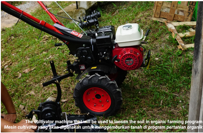
The cultivator machine that will be used to loosen the soil in organic farming program Mesin cultivator yang akan digunakan untuk mengemburkan tanah di program pertanian organik