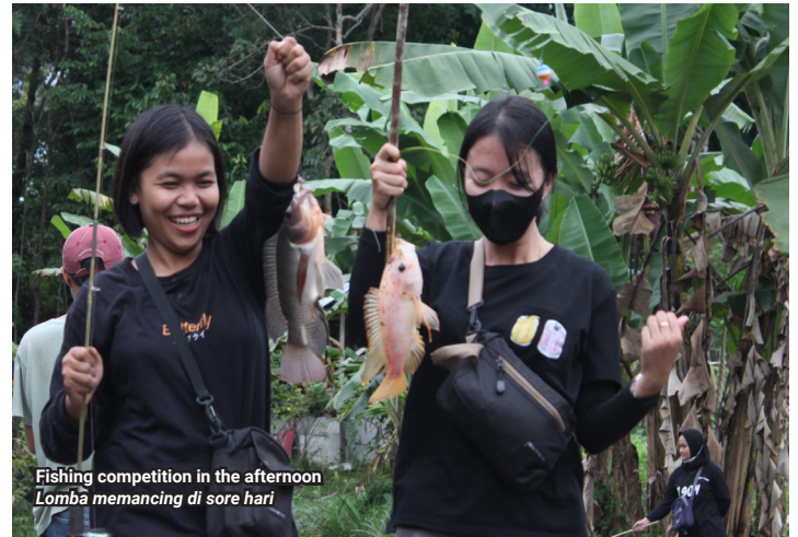
Fishing competition in the afternoon Lomba memancing di sore hari

On October 2-3, 2021, the SOC education team carried out awareness activities about orangutans and shared experiences about activities in the wild with friends from UKM Mapala STKIP Persada Khatulistiwa Sintang. This activity was carried out in the camping ground at the Jerora Forest School and was attended by new members of the UKM Mapala STKIP Persada Khatulistiwa Sintang.