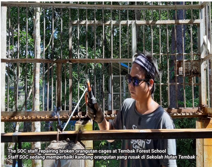
The SOC staff repairing broken orangutan cages at Tembak Forest School Staff SOC sedang memperbaiki kandang orangutan yang rusak di Sekolah Hutan Tembak

In October 2021, our team had carried out routine annual maintenance and repairs on the cages, especially the night cages at the rehabilitation center and at the Tembak and Jerora Forest Schools. Some of these cages were damaged by corrosion and damaged by the annoyance of juvenile and adult orangutans who like to poke the metal in their cages.