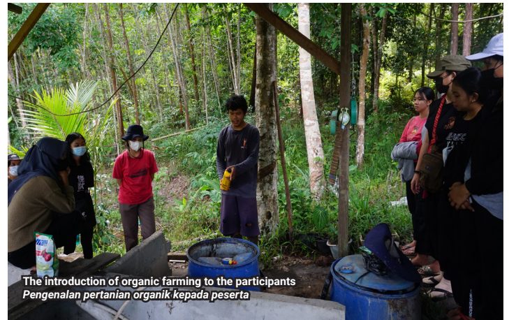
The introduction of organic farming to the participants Pengenalan pertanian organik kepada peserta