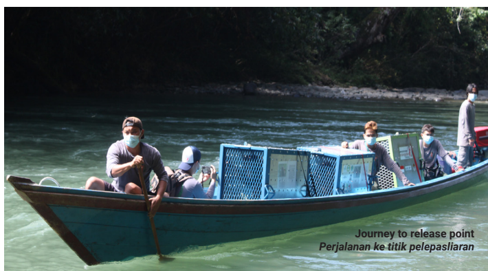
Journey to release point Perjalanan ke titik pelepasliaran

Pasca pelepasliaran ketiga orangutan betina ini, tim kami juga melakukan monitoring yang sedianya dilakukan selama 3 bulan dengan tujuan untuk memastikan ketiga orangutan ini dapat beradaptasi dengan rumah barunya serta tetap dalam keadaan sehat. Namun ternyata tim monitoring hanya bisa mengikuti jejak ketiga orangutan tersebut selama 9 hari (tanggal 9-17 Oktober 2021). Pada hari ke 10 tim telah kehilangan jejak ketiganya. Namun demikian, pencarian ketiganya masih terus dilakukan sampai satu bulan pasca pelepasliaran dan mereka masih tetap tidak ditemukan. Bisa dipastikan bahwa ketiganya telah mampu beradaptasi dengan baik di rumah barunya berdasarkan data pengamatan selama 9 hari. Pencarian dilakukan mulai dari titik pelepasliaran sampai ke area yang diperkirakan merupakan daerah jelajah orangutan.