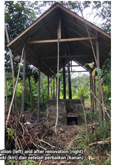
Biochar oven installation before renovation (left) and after renovation (right) Instalasi oven biochar sebelum diperbaiki (kiri) dan setelah perbaikan (kanan)

During 2021 our organic farming team has managed to harvest 1.67 Tons of vegetables and fruit. This yield is quite an increase from last year's crop yield of 1.5 tons. Hopefully next year the yield of organic farming can continue to increase in order to reduce the purchase of food from outside and provide healthier food for the orangutans in the Jerora Forest School. Thank you to SPCA International for supporting the organic farming program at the Jerora Forest School.