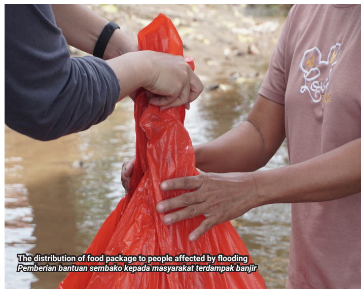
The distribution of food package to people affected by flooding Pemberian bantuan sembako kepada masyarakat terdampak banjir

Selama bencana banjir melanda Kota Sintang, semua lokasi kerja YPOS tidak ada yang terdampak banjir secara langsung. Namun akses jalan menuju ke kantor YPOS dan sekolah hutan terdapat genangan yang cukup dalam sehingga sulit dilalui oleh kendaraan selain mobil dengan 4 roda penggerak dan perahu. Selain itu pasokan pakan bagi orangutan juga sedikit terhambat serta mengalami kenaikan harga karena penjual pakan mengalami kesulitan pada distribusi stok pakan akibat banjir.