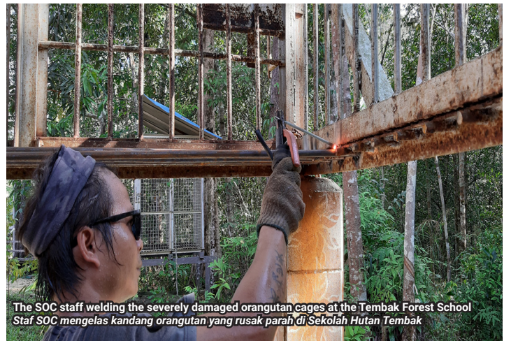
The SOC staff welding the severely damaged orangutan cages at the Tembak Forest School Staf SOC mengelas kandang orangutan yang rusak parah di Sekolah Hutan Tembak

Pada bulan Oktober 2021, tim kami telah melakukan perawatan dan perbaikan rutin tahunan pada kandang-kandang, terutama pada kandang inap di pusat rehabilitasi dan di Sekolah Hutan Tembak dan Jerora. Kandang-kandang tersebut ada yang mengalami kerusakan akibat korosi dan kerusakan akibat keusilan orangutan remaja dan dewasa yang suka mencungkil besi-besi yang di kandang inap mereka.